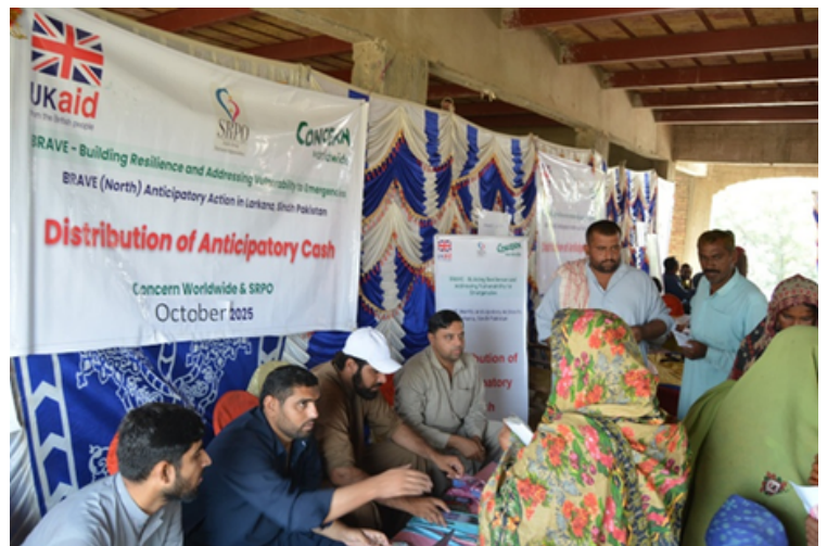
Distribution of MPCA in district Dadu, under FCDO funded BRAVE North AA programme, October 1, 2025