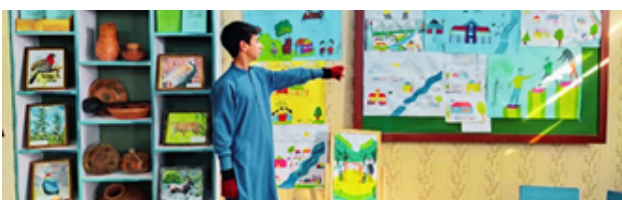
Art corner established at GPS school in District Gupis Yasin, GB in November 2025