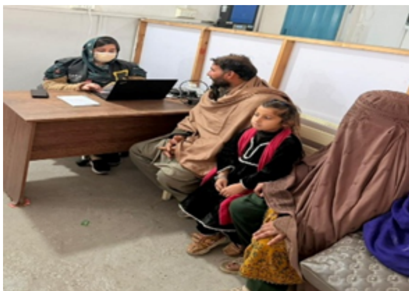
IRC- Child Protection and GBV Case Workers at UNHCR- Voluntary Repatriation Center (VRC) at Aza Khel. Facilitating Returning Families and Individuals