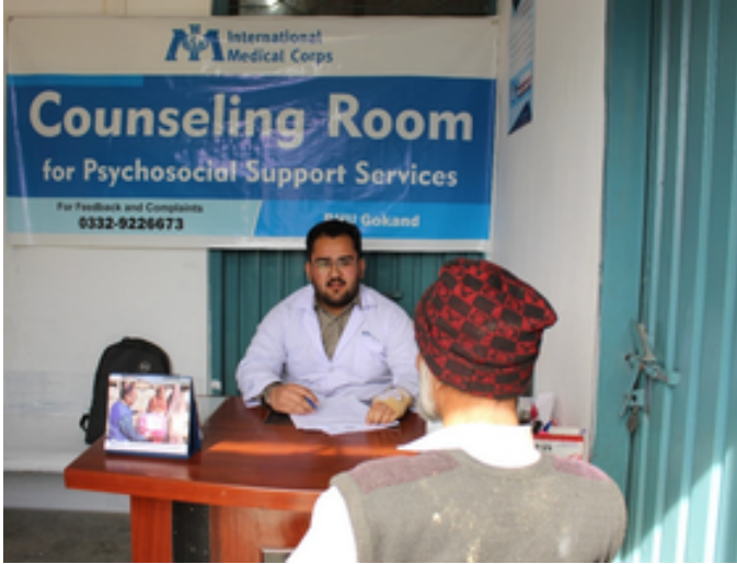
MHPSS Counselling session