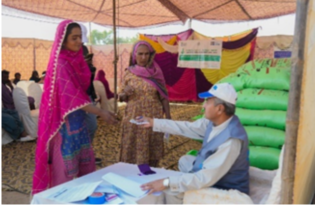
Participants receiving Fodder at the distribution site in Thatta

A total of 1,777 people received livestock fodder in drought-affected villages, helping protect their cattle and secure the primary source of food and income for families who rely on livestock for their daily needs.