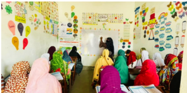
OOSC getting education in NFE center in District Jacobabad, Sindh, January 2026