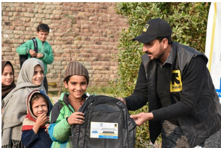
Children joyfully receiving PSS kits, promoting well-being, resilience, and psychosocial support.