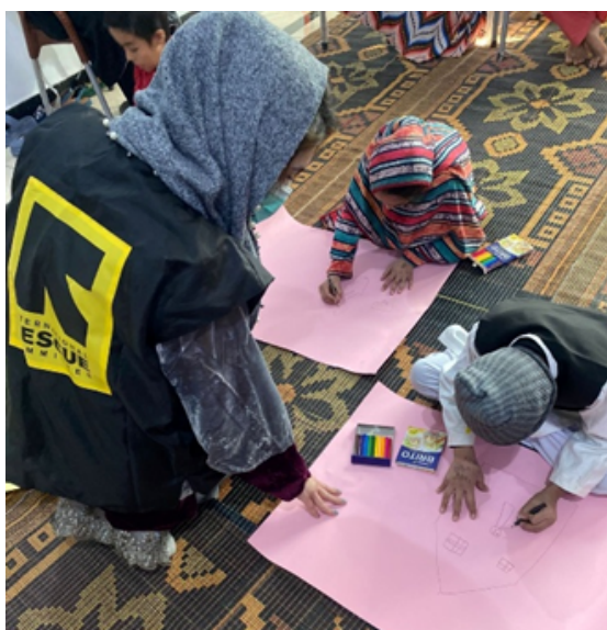
Celebrating 16 Days of Activism with GBV Survivors at Noor Education Trust- Shelter Home.