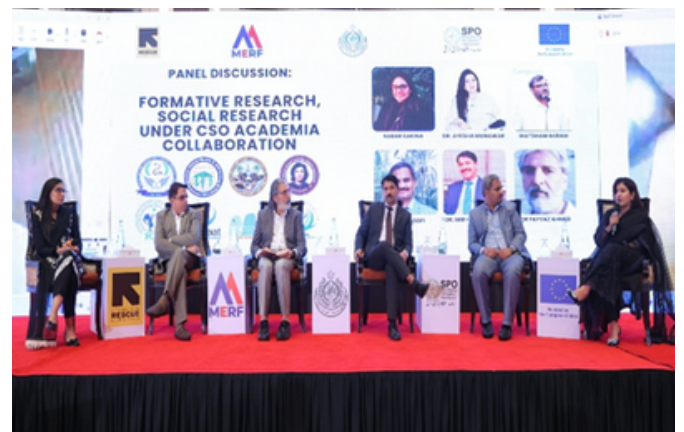
Panel discussion on ‘Formative and Social Research under CSO-Academia Collaboration’ with experts sharing insights and experiences.