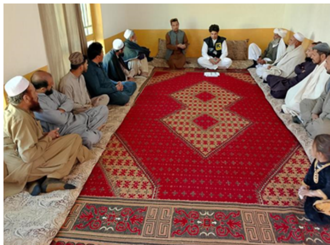
MAP session conducted with a male group to promote awareness and engagement.