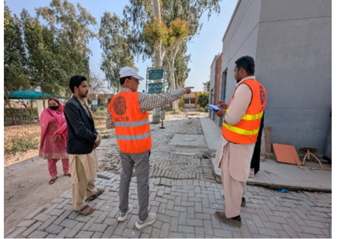
Acted conducted feasibility assessment for health care facility in District Multan, Punjab in January 2026