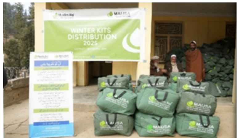
Winterization kits distribution in district Mansehra

Muslim Aid Pakistan has been officially certified by the Pakistan Centre for Philanthropy (PCP), recognizing its commitment to transparency, accountability, and excellence in philanthropic work.