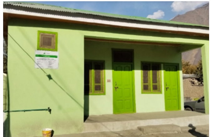
Climate-Resilient Smart House in KP