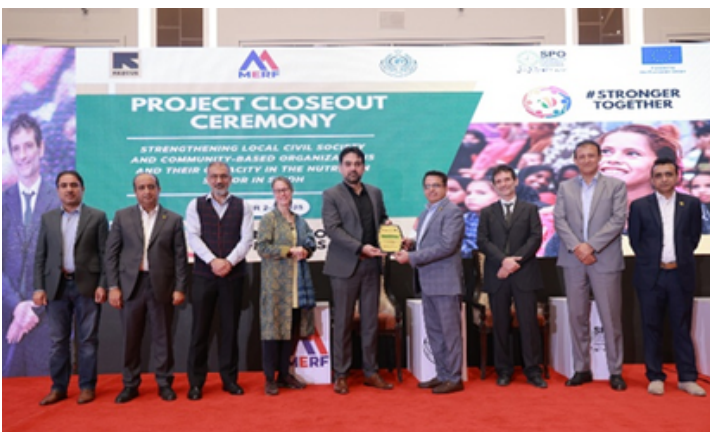
Marking the successful completion of the project, showcasing achievements.