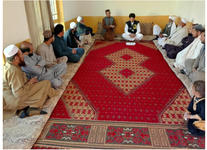
MAP session conducted with a male group to promote awareness and engagement.