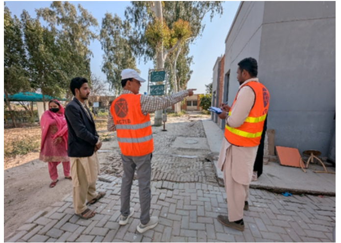
Acted conducted feasibility assessment for health care facility in District Multan, Punjab in January 2026