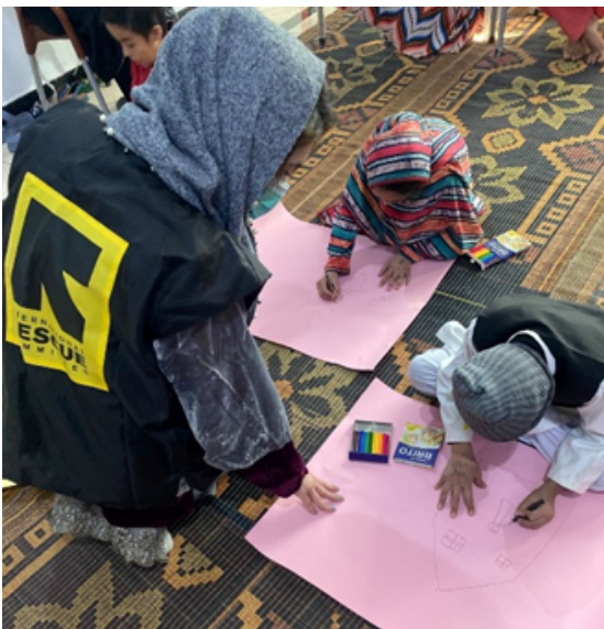
Celebrating 16 Days of Activism with GBV Survivors at Noor Education Trust- Shelter Home.