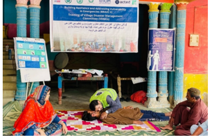
Training of VDMC members on CBRM including Firefighting, Search, and Rescue in District Jaffarabad, Balochistan, November 2025