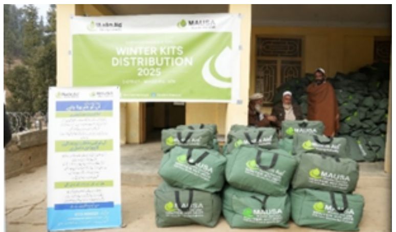
Winterization kits distribution in district Mansehra

Muslim Aid Pakistan has been officially certified by the Pakistan Centre for Philanthropy (PCP), recognizing its commitment to transparency, accountability, and excellence in philanthropic work.