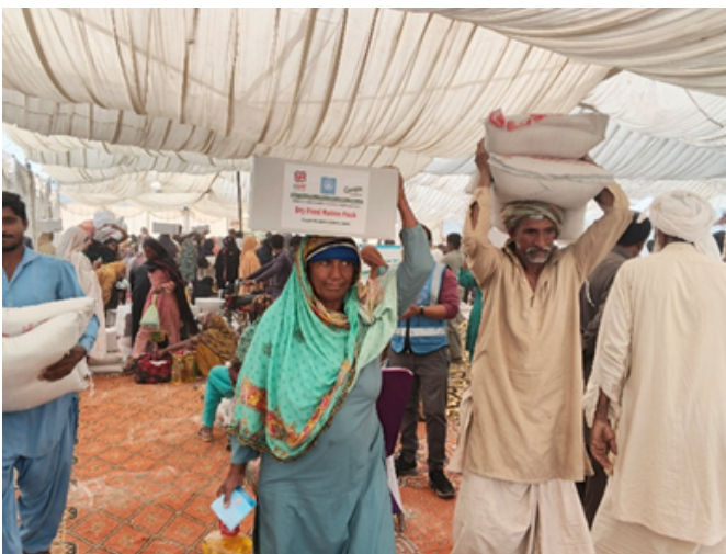
Figure 1: Distribution of Dry Food Ration under FCDO funded BRAVE North programme; at Union Council Pakk Makhdoom, District Muzaffargarh, 29 October, 2025

Concern Worldwide Pakistan delivered integrated humanitarian and resilience-building programmes across 18 districts of Khyber Pakhtunkhwa, Punjab, and Sindh, with funding from FCD0, U.S. Department of State (PRM), Z Zurich Foundation, International Relief Teams (IRT), and Concern's own resources. The programmes collectively reached 218,587 individuals; including 106,763 women and girls and 6,557 persons with disabilities; through coordinated interventions in health, WASH, livelihoods, non-food items, and climate change adaptation. Reflecting Concern's commitment to the localization agenda, nine national NGOs were engaged as implementing partners, with dedicated investment in strengthening their technical and institutional capacities. Flood-affected households received 10,214 food ration packs, 3,690 kitchen sets, 4,090 bedding kits, and 3,800 hygiene and dignity kits. Multipurpose Cash Assistance (MPCA) reached 17,244 households, while 30 mobile medical camps delivered critical health services to remote communities. As part of the WASH early recovery; rehabilitated 282 latrines, 72 water facilities, and 115 handwashing stations. Agricultural recovery support reached 6,352 households through provision of Agri Inputs (Wheat seeds and Fertilizers), and 10 community infrastructure schemes were restored to revive local livelihoods and connectivity.