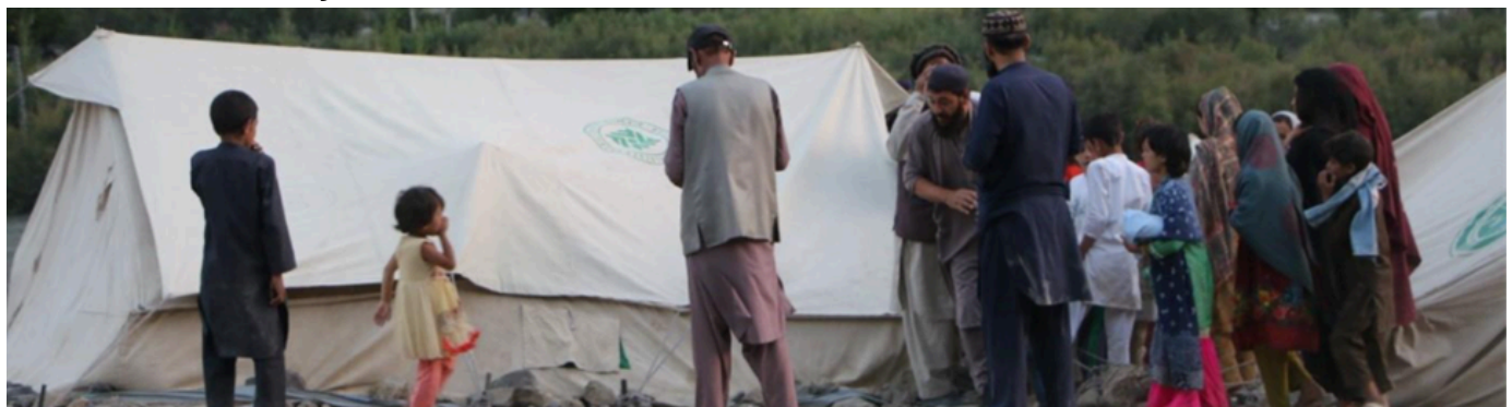
Families at tent village installed for flood affected at Talidass GLOF event

Engineers and volunteers also worked urgently to rehabilitate damaged water systems and restore safe drinking water.