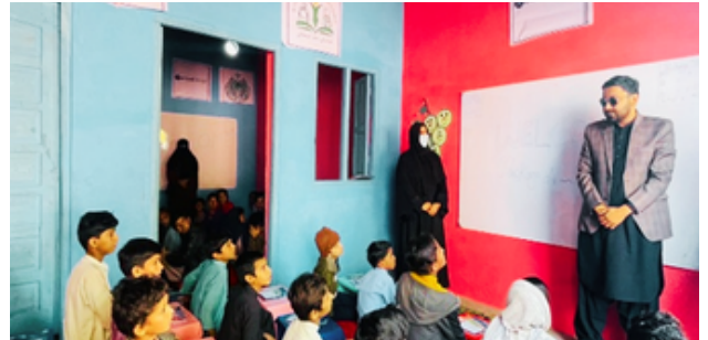
Opening Ceremony of NFE center established in District Kashmore, Sindh in January 2026