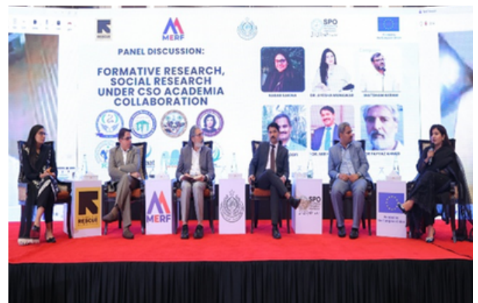
Panel discussion on ‘Formative and Social Research under CSO-Academia Collaboration’ with experts sharing insights and experiences.