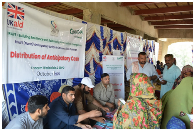
Figure 2: Distribution of MPCA in district Dadu, under FCDO funded BRAVE North AA programme, October 1, 2025