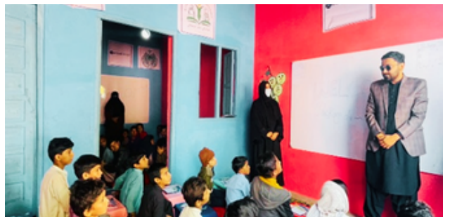
Opening Ceremony of NFE center established in District Kashmore, Sindh in January 2026