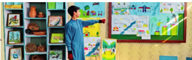
Art corner established at GPS school in District Gupis Yasin, GB in November 2025