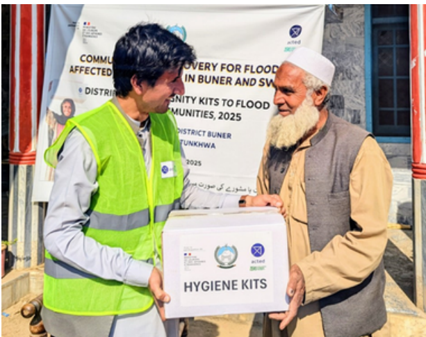
Distribution of Shelter NFIs to flood-affected communities in District Buner, KP,