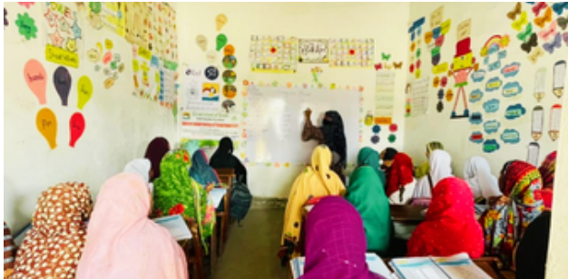
OOSC getting education in NFE center in District Jacobabad, Sindh, January 2026