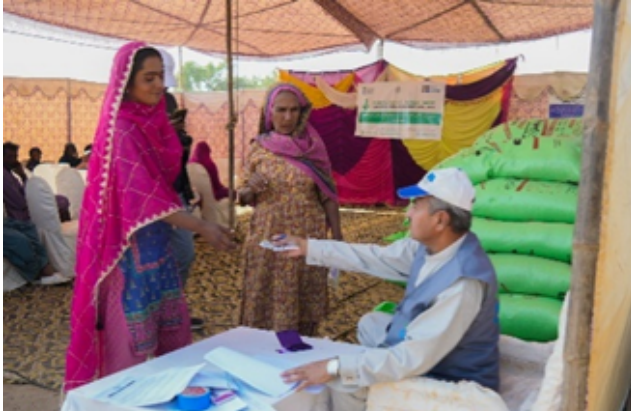
Participants receiving Fodder at the distribution site in Thatta

A total of 1,777 people received livestock fodder in drought-affected villages, helping protect their cattle and secure the primary source of food and income for families who rely on livestock for their daily needs.