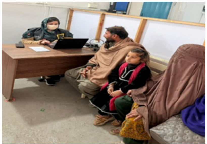
IRC- Child Protection and GBV Case Workers at UNHCR- Voluntary Repatriation Center (VRC) at Aza Khel. Facilitating Returning Families and Individuals