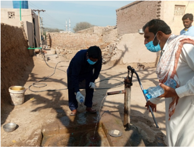
Pre Water Sampling for Installation of Hand pumps in District Multan, Punjab, January 2026