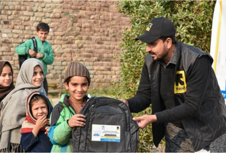
Children joyfully receiving PSS kits, promoting well-being, resilience, and psychosocial support.