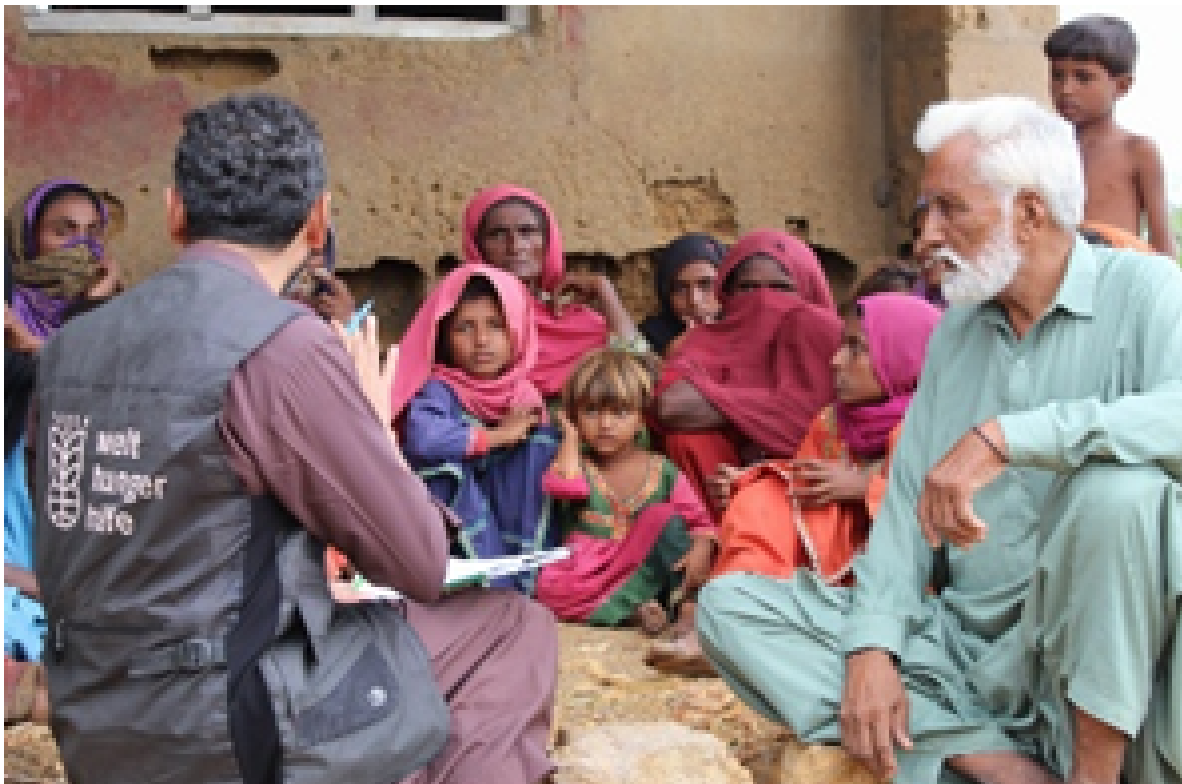
Welthungerhilfe staff engaging with community members to assess needs and provide targeted support for recovery and resilience.

o WHH, RDF and Sindh Technical Education and Vocational Authority, Government of Sindh initiated the process to introduce trades aligning with growing needs of the green economy into TVET curriculum with a study "Mapping and Market Assessment of Green Skills".