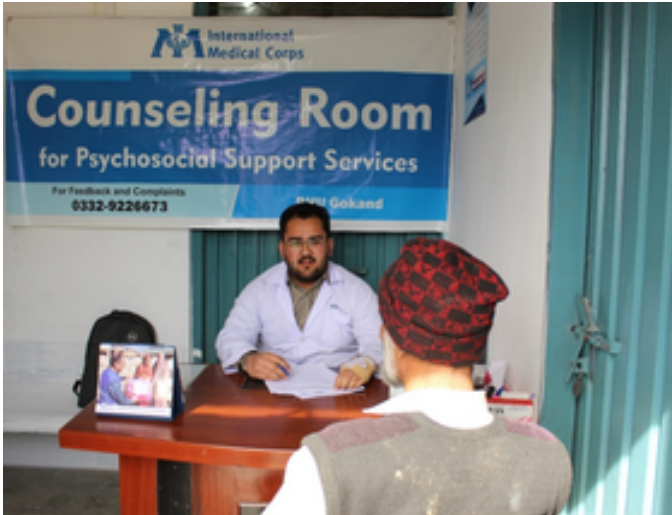
MHPSS Counselling session