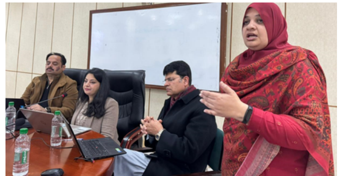
EiE partners orientation on PGI & GBV risk mitigation, ECW Anticipatory Action Pilot – January 2026

contingency plan, analysed priority education risks, and agreed on coordinated response strategies. The Pakistan Institute of Education (PIE) shared validated 2025 flood damage data, while provincial Education in Emergencies (EiE) focal persons presented key lessons learned to strengthen preparedness.