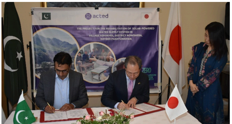
Contract signing ceremony between Acted and Government of Japan at Embassy of Japan in Islamabad, October 2025

Acted commenced implementation of the Water Access for Sustainable, Inclusive Livelihoods and Empowerment project in October 2025, supported by the Government of Japan through the Embassy of Japan, to rehabilitate the water supply scheme in Village Ashakhel, District Nowshera.