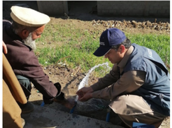
Monitoring of Water Scheme at Motatangi Shangla