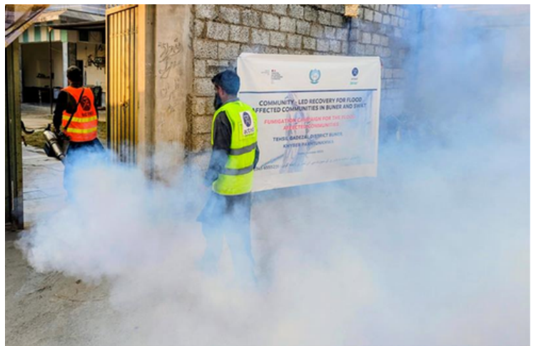
Fumigation and vector control campaign conducted for flood-affected communities, aimed at reducing the risk of vector-borne diseases and safeguarding community health in District Buner in October 2025