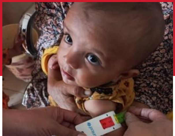
MUAC check by PPHI staff