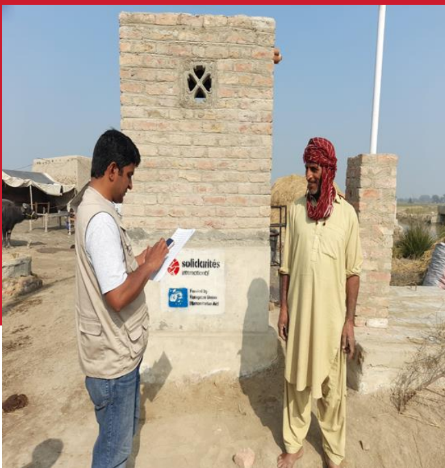
During the feedback from Shared latrine beneficiaries