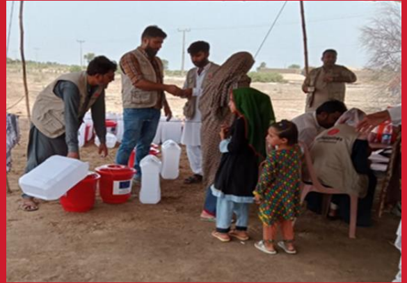
Distribution of Hygiene Kits