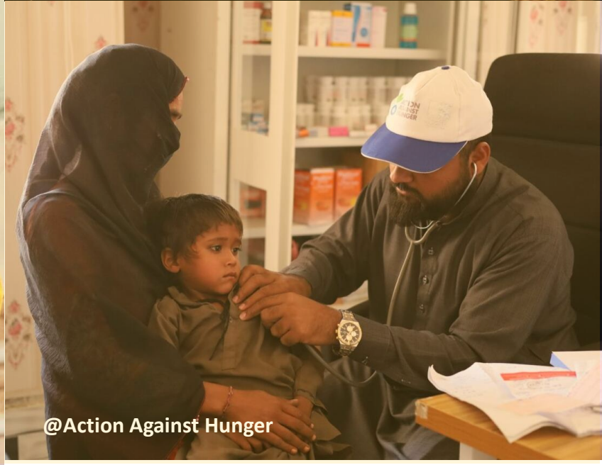
@Action Against Hunger