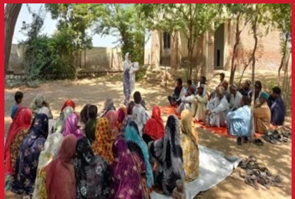
Sessions on the communities