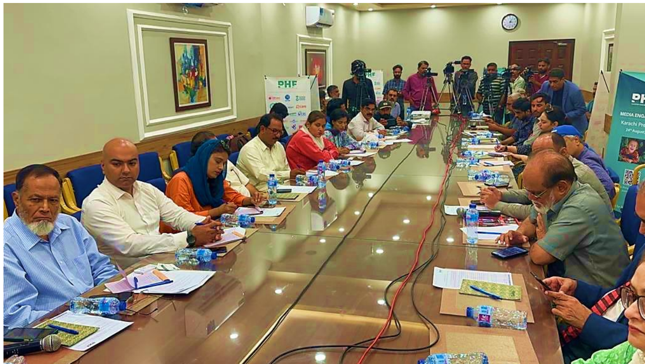
PHF Press Briefing at Karachi Press Club