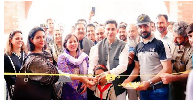
IRC and UNICEF in a joint effort in collaboration with Govt of Pakistan inaugurated a Child protection Unit in Rajanpur.