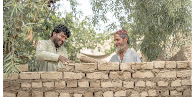
As part of flood response 2022, IslamicReliefPK built zero carbon shelters & homes for #Pakistan's flood victims.