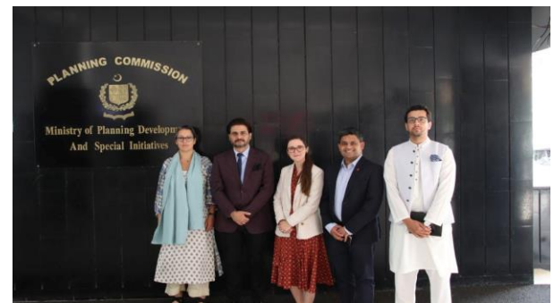
Inger Ashing, CEO of Save the Children Int, met with government departments to promote collaboration for climate-resilient child-focused recovery after the 2022 floods.