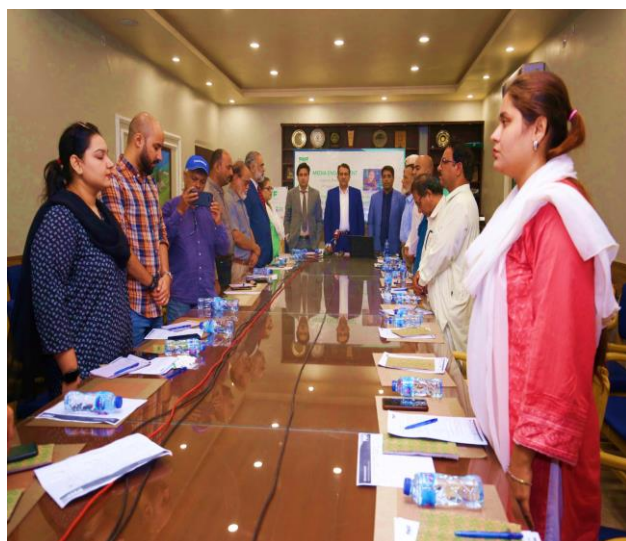
Press briefing at Karachi Press Club.