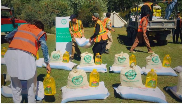
Distribution of food items among flood affected communities in Gilgit-Baltistan and Chitral.