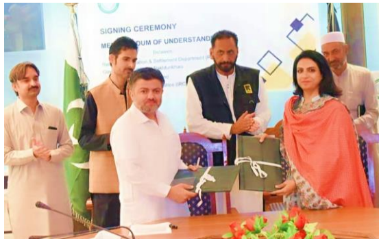
IRC signed a long-term MoU with the Department of Relief and Rehabilitation, government of KPK.