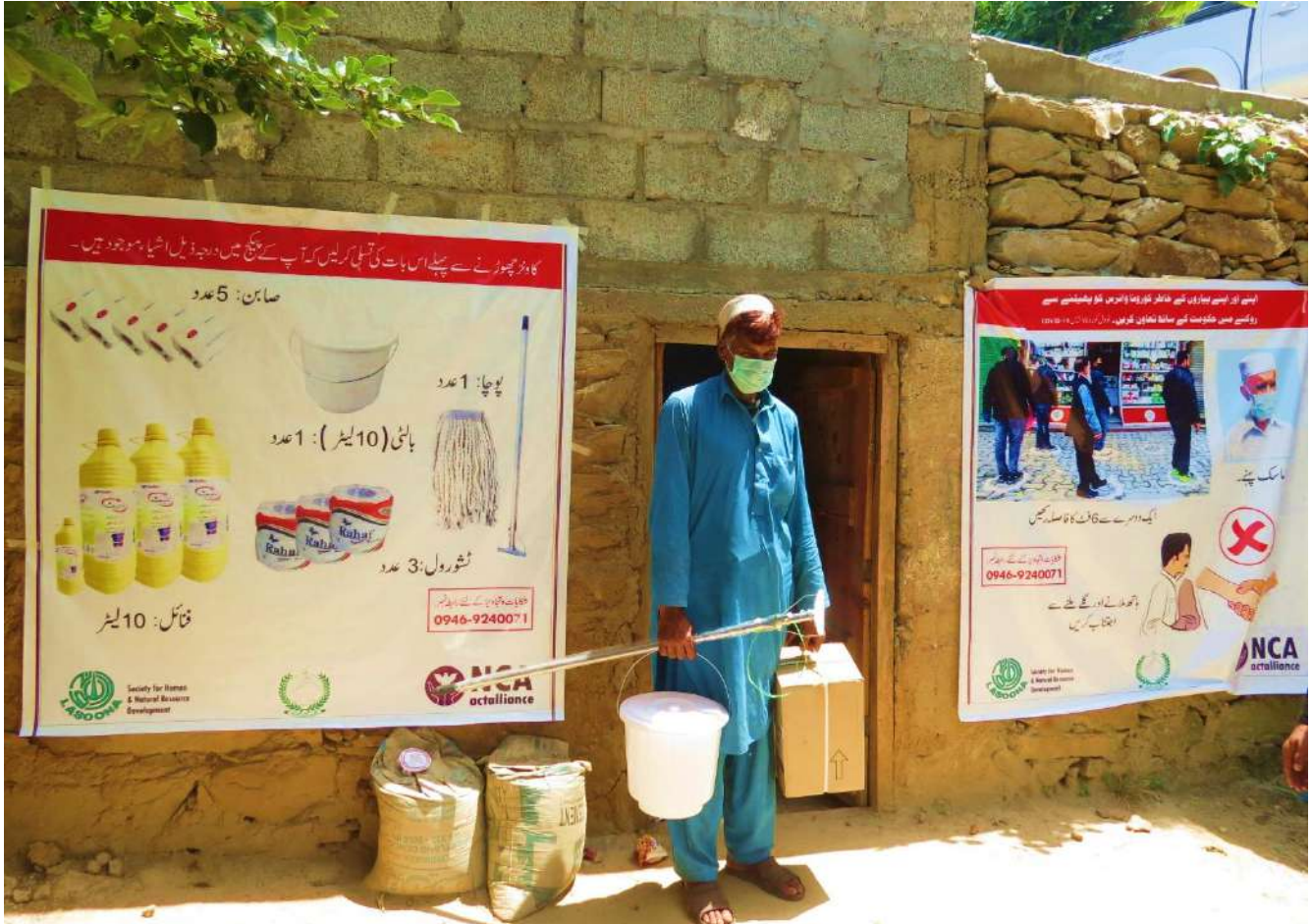
@ Norwegian Church Aid (NCA)

For more information, please click here .