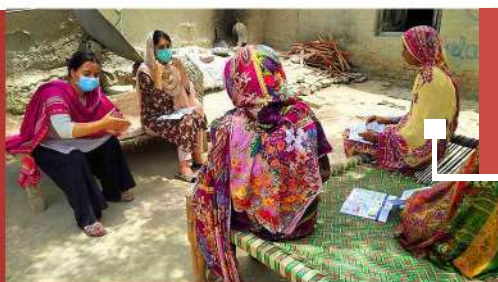
Colleagues from Bedari carry out a door to door session on gender-based violence with women and girls with disability

360 students were supported for BSVS in ISRA school and LRBT School Karachi, COAVS, Lahore and Pakistan Institute of Community Ophthalmology, Peshawar who were trained as mid-level ophthalmic personnel deployed to provide quality, inclusive comprehensive eye health services.