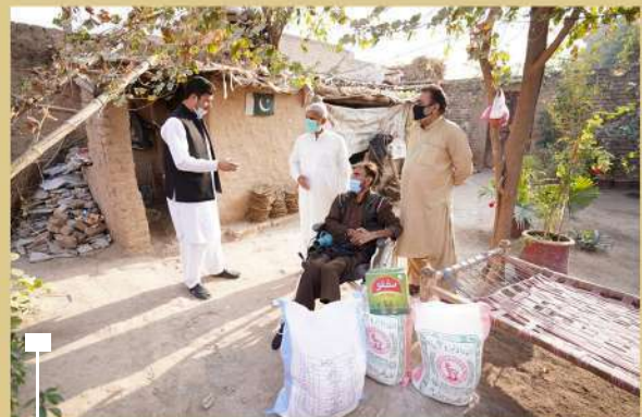
CIP team during discussion with village committee members