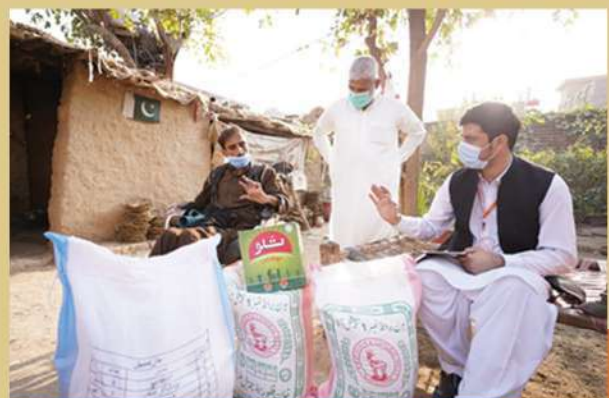
CARE Pakistan team during discussion with a disable beneficiary assisted with food and hygiene package – CIP - LDSC