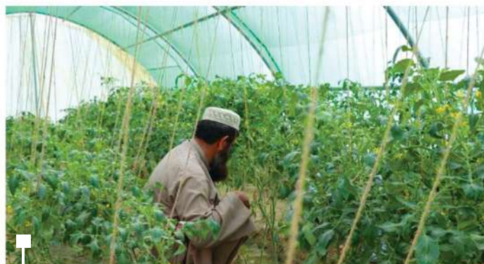
A farmer growing off- season vegetables in a water efficient green tunnel provided by Islamic Relief