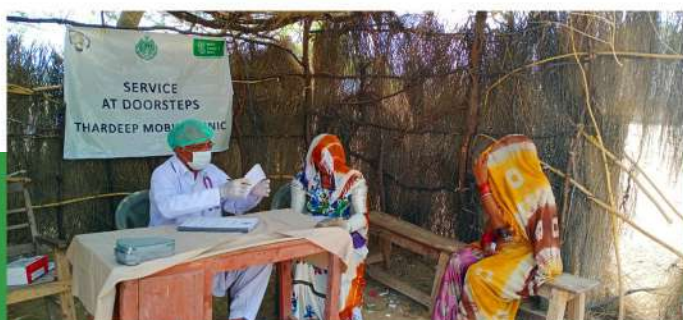
Welthungerhilfe Doctor doing check up of patients in a village of UC Faqueer Abdullah in Umerkot

The overall goal of the project is to explore sustainable indigenous solutions for the malnutrition issues for Thar desert population. The project includes mapping the available flora in the desert, nutritional value checking of the mapped flora, recipe preparation from the nutritionally potential flora and testing of the recipes in the malnourished communities to record their effectiveness and acceptability. The project will help to identify sustained indigenous dietary solutions for PLW and children under 2 of the desert areas and has benefitted 1,451,546 beneficiaries so far.