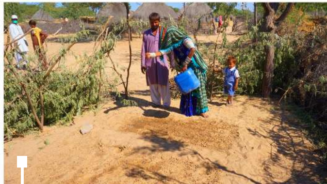
PVDP-DKH-Watering of Kitchen Garden, Village Sakrio, Old Bhee, UC Vejhiar, District Tharparkar, Sindh, Pakistan