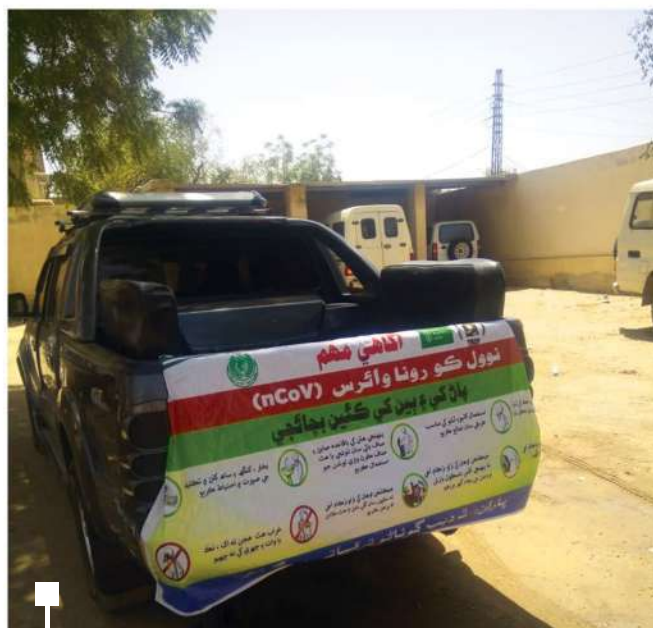
Welthungerhilfe awareness campaign vehicle with banners

Humanitarian assistance was provided to improve living conditions of flood-affected families through relief and early recovery support targeting 32,900 beneficiaries.