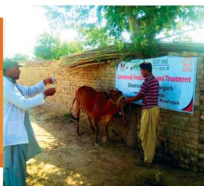
Vaccination of livestock during flood response in District Muzaffargarh

Under the project, CARE International benefited 6,600 residents of Pishin, Balochistan, via provision of food and hygiene material. Some 1,100 food packages and 1,100 hygiene kits were distributed among the vulnerable communities of three Union Councils: Bostan, Gez and Walma. CIP also conducted IPC activities that included 44 hygiene sessions and display of IEC materials at several locations across the district. Awareness messages were disseminated via Radio Pakistan as well.