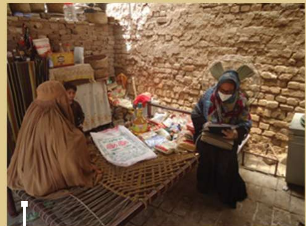
MEAL assistant carrying out beneficiary assessment during spot check

This approach ensured adherence to government prescribed social distancing so that the beneficiaries were not exposed to the virus while receiving the goods.