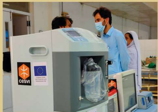
Cesvi_Provision of essential medical equipment to government health facilities in KP