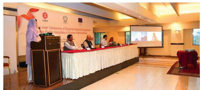
Handing over ceremony for life-saving medical equipment to government health facilities in six KP districts

To meet this need, Cesvi is providing PPEs to 20 flood-affected hospitals in five districts of Sindh, as well as to relief workers engaged in on-going flood response in the target areas.