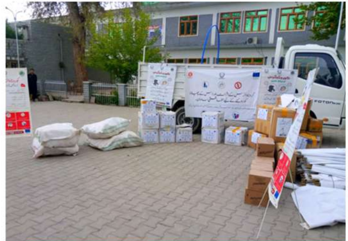
Distribution of PPEs in North Waziristan

Living in cramped temporary settlements without most of their belongings, thousands of flood-affected families did not have access to or the means to buy hygiene or sanitation items to meet their WASH needs. Hence, Cesvi provided WASH NFI kits to 3,500 vulnerable families. These kits comprise of soaps, buckets, plastic mugs, nail cutters, miswaks, mosquito nets, jerry cans and other utensils.