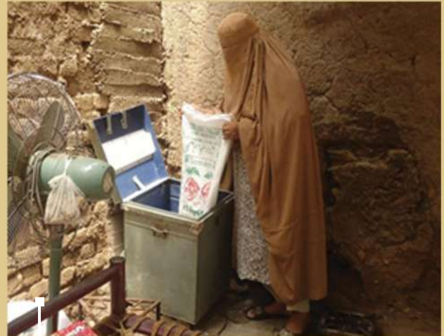
A local woman opening the ration pack she received from CARE International Pakistan

“The food package was like a miracle for me and my family in this crucial time.” says Muhammad. Food packages were distributed to protect vulnerable community members from starvation due to absence of livelihood options and food insecurity. The project adopted the Door to Door (DTD) mechanism for distribution of food packages and hygiene kits.