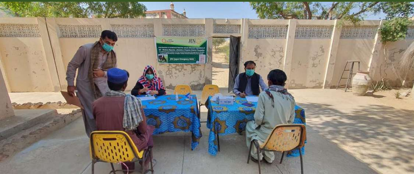
JEN distributed livestock feed in UC Posarko in Tharparker, Sindh