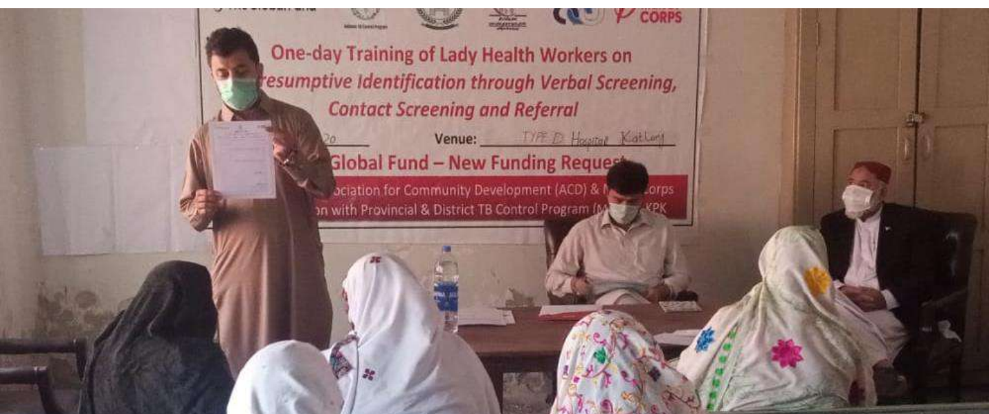
Mercy Corps conducting one-day session for Lady Healthworkers in Mardan, KP