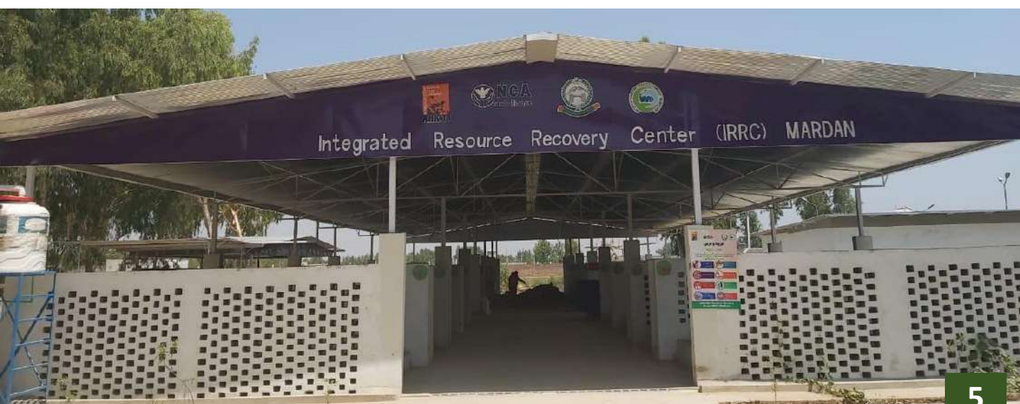
NCA handed over of Waste Management Facility to Water and Sanitation Company Mardan, KP