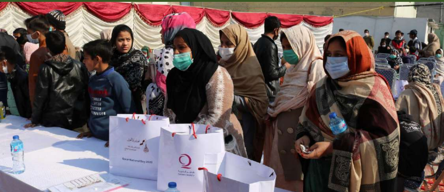
Qatar Charity distributed hygiene kits in District Rawalpindi, Punjab